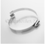
Clip-Grip hose clamp, screwable