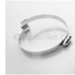
Clip-Grip special hose clamp