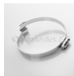
Clip-Grip special hose clamp