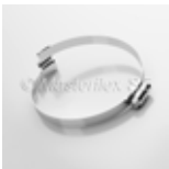
Clip-Grip special hose clamp