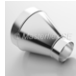
Hose reducer, symmetrical