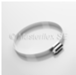
Hose clamp with worm-gear drive