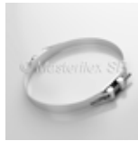
Hose clamp with round pins