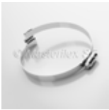
Master-grip hose clamp, screwable