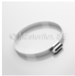
Hose clamp with worm-gear drive