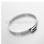
Hose clamp with worm-gear drive