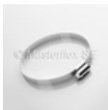
Hose clamp with worm-gear drive