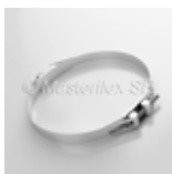
Hose clamp, bolt clamp

Masterduct, Inc. 5235 Ted Street Houston, TX 77040 USA Tel. +1 713 462-5779 Tel. +1 800 318-3300 Fax +1 713 939-8441 www.Masterduct.com