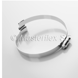
Car-Grip hose clamp, screwable

Masterduct, Inc. 5235 Ted Street Houston, TX 77040 USA Tel. +1 713 462-5779 Tel. +1 800 318-3300 Fax +1 713 939-8441 www.Masterduct.com