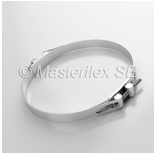
Hose clamp, bolt clamp