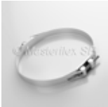
Hose clamp, bolt clamp