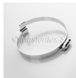
Car-Grip hose clamp, screwable