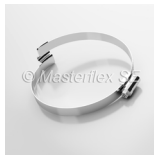
Car-Grip hose clamp, screwable