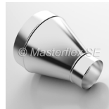
Hose reducer, symmetrical