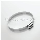
Hose clamp with worm-gear drive