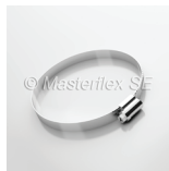
Hose clamp with worm-gear drive