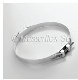
Hose clamp with round pins