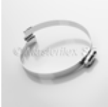
Clip-Grip hose clamp, screwable