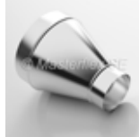
Hose reducer, symmetrical