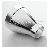
Hose reducer, symmetrical

Masterduct, Inc. 5235 Ted Street Houston, TX 77040 USA Tel. +1.713.462.5779 Tel. +1.800.318.3300 Fax + 1.713.939.8441 www.masterduct.com