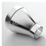
Hose reducer, symmetrical

Viton® is a registered trademark of DuPont Dow Elastomers.