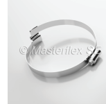
Clip-Grip special hose clamp