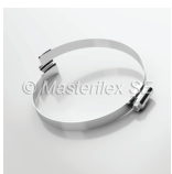
Clip-Grip special hose clamp