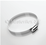
Hose clamp with worm-gear drive