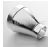
Hose reducer, symmetrical

KAPTON® is a registered trademark of DuPont Dow Elastomers.