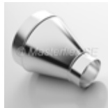
Hose reducer, symmetrical

Viton® is a registered trademark of DuPont Dow Elastomers.