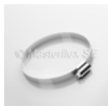
Hose clamp with worm-gear drive