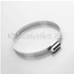
Hose clamp with worm-gear drive