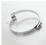
Clip-Grip special hose clamp