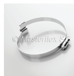
Clip-Grip special hose clamp